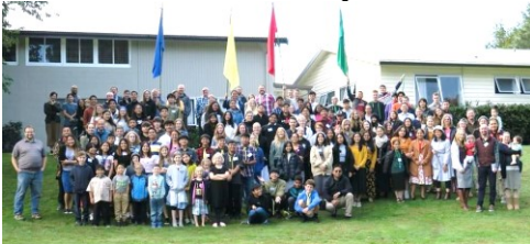
NZBBTP Students at Camp