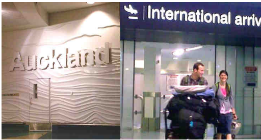
Teen Camp 2012