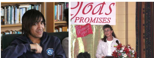
Family (Heritage) Camp