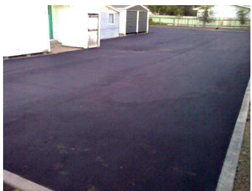
Teen Camp 2011