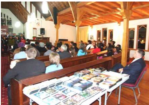
Youth Winter Camp-out