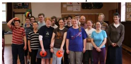
Young Lady That Received Christ