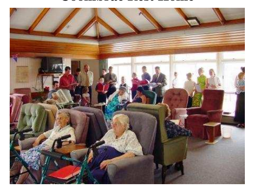
Leading Coombrae Resident to Christ