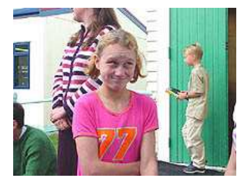
Men's Retreat 2005