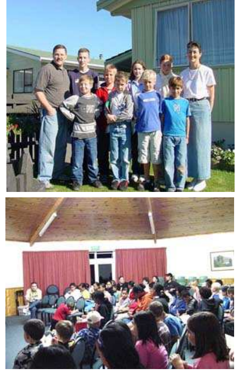
Kapiti Baptist Church Baptisms