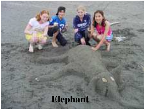
NZ Baptist Bible Fellowship