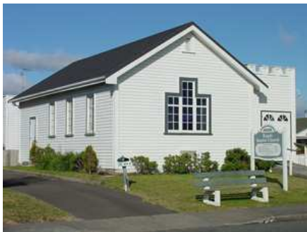
Kapiti Baptist Church

P.O. Box 191 Springfield, MO 65801-0191 BBFI – Acct. No. 069050 Phone: 417-862-5001