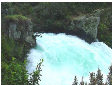
New Zealand's Splendor (Huka Falls)