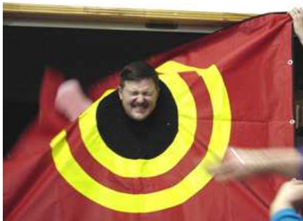
Guy's Initiation in to Teen Camp